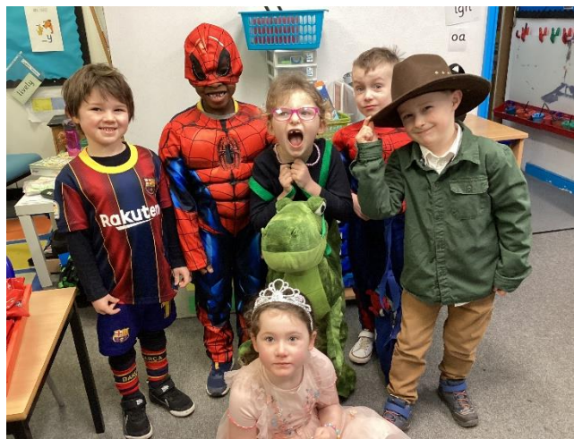
Dress to Express Day 2023

In order to continue to promote positive mental wellbeing we take part in Children's Mental Health Week annually and in events such as 'Dress to Express Days' where children are encouraged to be themselves.